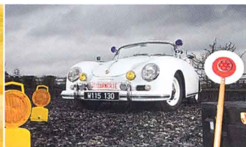
356A POLICE CAR Nut and bolt restoration of Porsche's original squad car