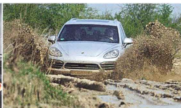
NEW CAYENNE First drive of Porsche's all-new SUV