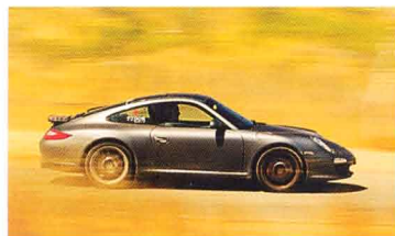
AUSTRALIAN EPIC Leg two of our mega lap of Oz in a 911

PLUS: TECHNO CLASSICA REPORT ● AKRAPOVIC EXHAUST PROFILE ALL YOU NEED TO KNOW: PORSCHE CERAMIC COMPOSITE BRAKES