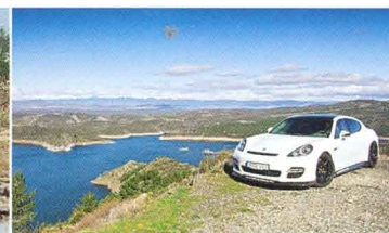
PANAMERA CARBON Oakley Design reveals carbon edition saloon