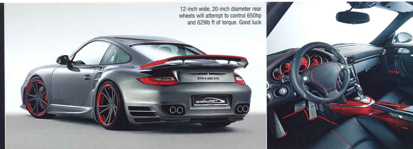
12-inch wide, 20-inch diameter rear wheels will attempt to control 650hp and 629lb ft of torque. Good luck

Porsche specialist, Speedart, has released details of its most extreme tuning programme for the generation two 997 Series 911 Turbo, which sees the twin-turbocharged engine generate 650hp and 629lb ft of torque, an increase of 150hp and 150lb ft over the standard engine. At the heart of the conversion is a larger pair of VTG turbochargers, controlled by a modified ECU to take into account their increased appetite for exhaust gases. Speedart has also fitted a new, freer-breathing exhaust